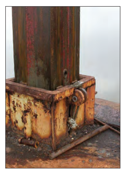
Photos showing spud with securing pin lying alongside (left) and with securing pin inserted (right).

During marine construction work deck barges are held in place by vertical steel shafts known as spuds. The spud equipment typically consists of forward and aft spuds and a diesel engine-powered spud winch. Three methods are available to prevent the spud from accidentally dropping or slipping: latching the winch foot brake; engaging a steel pawl that fits into a notched ring on the outside of the winch drum; and inserting a steel securing pin directly through the fully raised spud, preventing it from free-falling if the winch or cable fails.